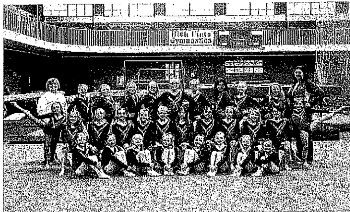
HUG Competitive Traveling Team 2017-2018